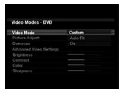
Figure 35 — Video Modes Custom Processing

Set the Video Mode to Custom to display the picture settings, as shown in Figure 35.